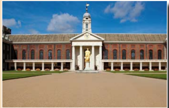
Figure Court, one of the oldest and renowned areas of the Royal Hospital takes its name from the golden statue of King Charles II being located at its heart. This prestigious area required a new surface that would enhance the elegant backdrop, have low maintenance requirements and be suitable for disabled access. The pensioners found the existing gravel footpaths difficult to negotiate.

The Royal Hospital is located in the Chelsea district of central London, now the Royal Borough of Kensington and Chelsea. The hospital was commissioned and founded in 1682 by King Charles II for soldiers who were unfit for further duty due to injury or old age. The picturesque building was designed by Sir Christopher Wren, his inspiration was the "Hôpital des Invalides" in Paris. It has become the home of the Chelsea Pensioners, veterans of war and is a monumental part of London. The historical building is as breathtaking today as it was on its completion in 1682.